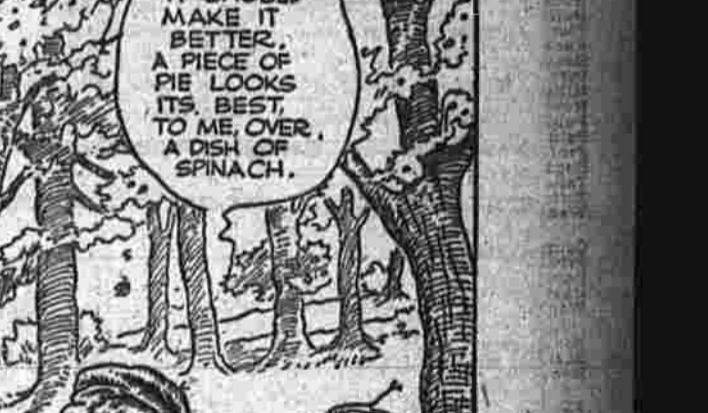
ALLEY OOP She'll See Plenty of Dinosaurs, Now By HAMLIN