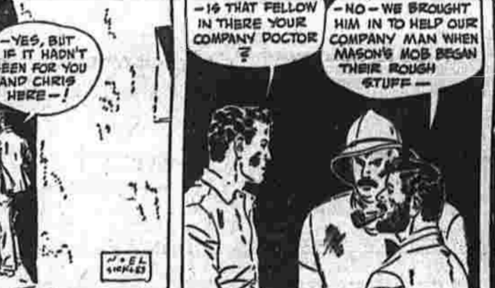
WASHINGTON TUBS By Crane