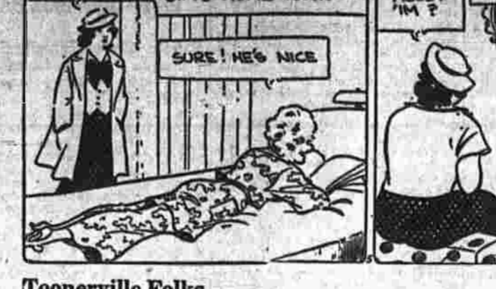
TOONVILLE FOLKS By Pontaine Fox